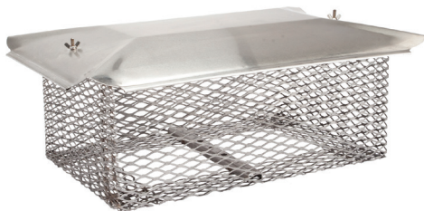
Stainless Steel, 5/8" Mesh