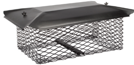
Black Galvanized, Standard 3/4" Mesh

Arrests Sparks and Reduces Certain Downdrafts