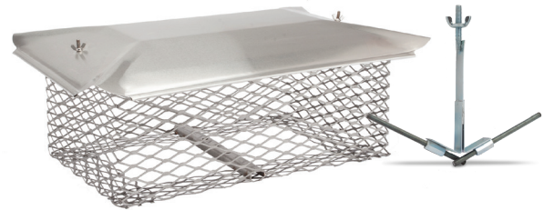
Stainless Steel, Standard 3/4" Mesh