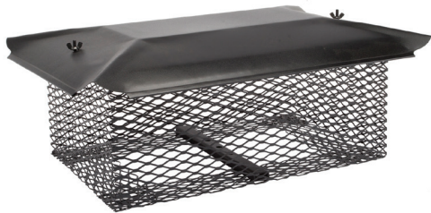
Black Galvanized, 5/8" Mesh